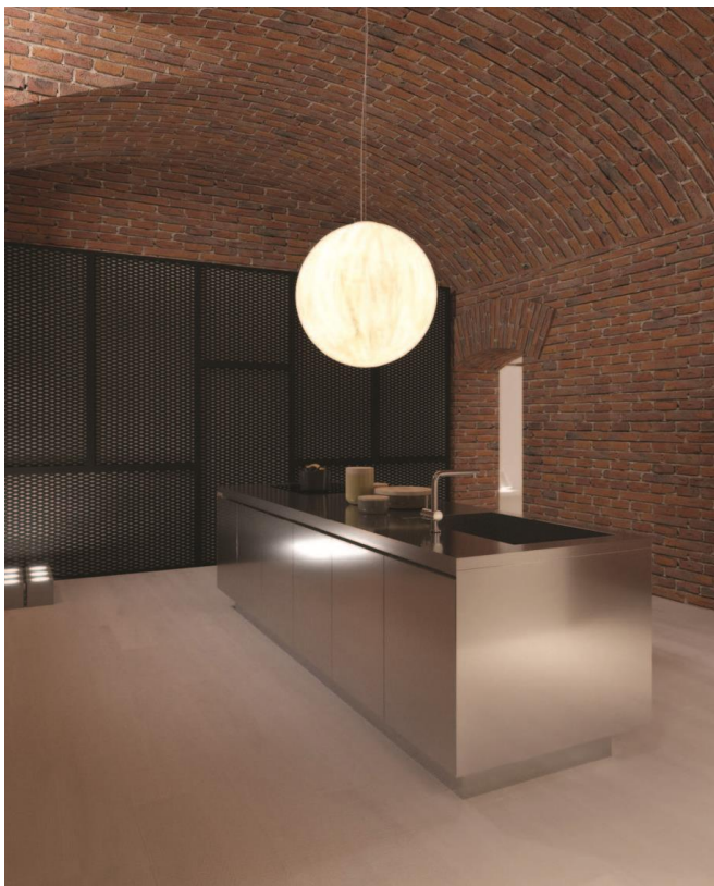
Grad45, kitchen with new "Vibrant" finish 2017