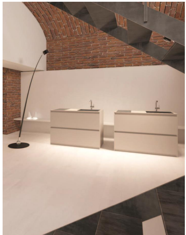
Ceragino, kitchen with new finish 2017

Davide Groppi's lighting project completes the installation, enhancing the different spaces. A scenic setting able to highlight Sanwa Company statement: "modern in style - Japanese in spirit".