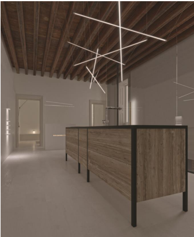
Patina, kitchen 2017

“ Japanese Modern Vintage ” is a contemporary concept of blending in vintage spaces and modern furniture, mixing past and future, thus creating a fashionable though intimate atmosphere, thanks also to the set up designed and curated by Bestetti Associati.